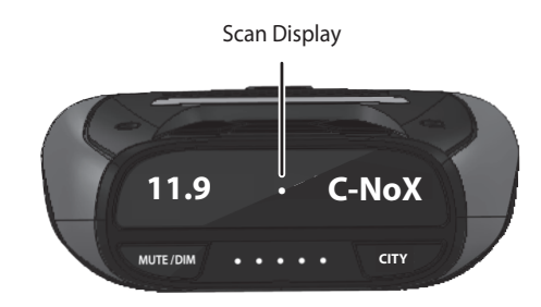
Elements on the screen vary according to what you turn on and off in the Menu system

A small dot on the screen indicates that the unit is scanning for signals . This dot travels back and forth in the middle of the screen.