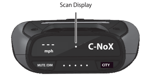
Elements on the screen vary according to what you turn on and off in the Menu system

A small dot on the screen indicates that the unit is scanning for signals . This dot travels back and forth in the middle of the screen. You can turn this display on and off in the Menu system.